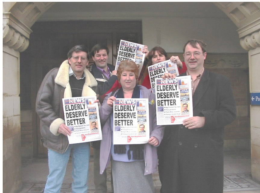
Local people have joined the Liberal Democrats national campaign to axe the Council Tax

Your Council Tax has soared under the Tory run County & Borough Councils. This is despite their promises to keep taxes down.