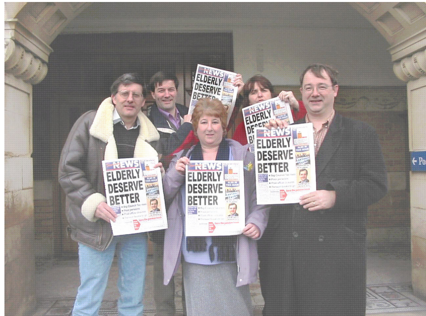
Local people have joined the Liberal Democrats national campaign to axe the Council Tax